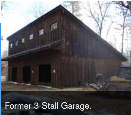
Former 3-Stall Garage.

Read more about this project at: http://www.covenantpines.org/youth/summer-missions-project.php