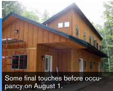
Some final touches before occupancy on August 1.