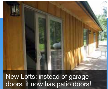
New Lofts: instead of garage doors, it now has patio doors!